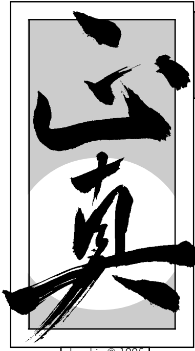
sho-shin © 1995