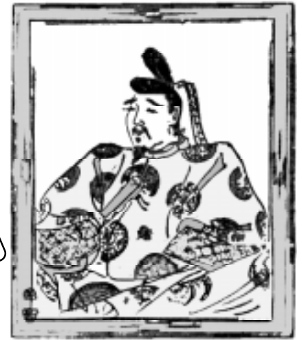
GOTOKU-JOKO Emperor in Retirement

KIKU GYO-SAKU SHO-GEN 1207 - GOTOKU JOKO "Emperor in Retirement"