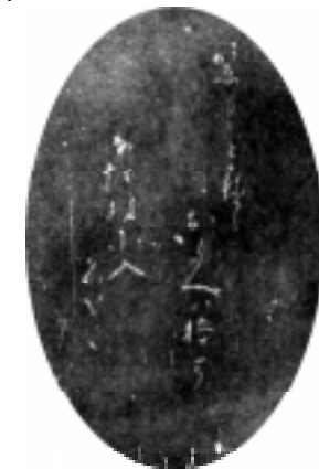
Last poem at NYOIRIN-JI

KUSUNOKI MASATSURA, his brother MASATOKI and cousin WADA TAKAHIDE died with all their partisans at SHIJO-NAWATE defending the Imperial cause. He was 22. The SHIJO-NAWATE JINJA, at the foot of nearby Mt. IIMORI, commemorates him.