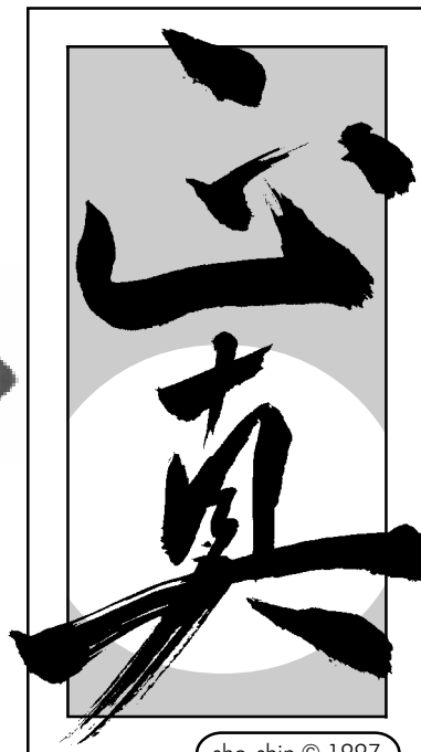
sho-shin © 1997